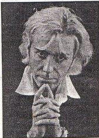
What Tedd did next at CD.

The year began on the right foot when the ballet moved into a brand new building in January and then completed all the fundraising for capital costs in December.